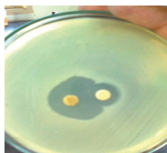
[Table/Fig-2]: Imipenem - EDTA double disk synergy test. Left - Imipenem disk (10 \mu g), Right- EDTA (10 \mu l) disk. A synergistic zone between two disks.

producers . Among the 126 isolates of Pseudomonas aeruginosa , 10 [7.8 %] isolates were metallo \beta lactamase producers and these were isolated from 16 imipenem resistant isolates. Hence, the percentage of MBLs in the imipenem resistant isolates was 62.5 %. Also, those 10 MBL producing strains were also resistant to netilmicin, gentamicin and ciprofloxacin (9) each and tobramycin and amikacin (8) each. None of the isolates showed the coexistence of ESBL and MBL.